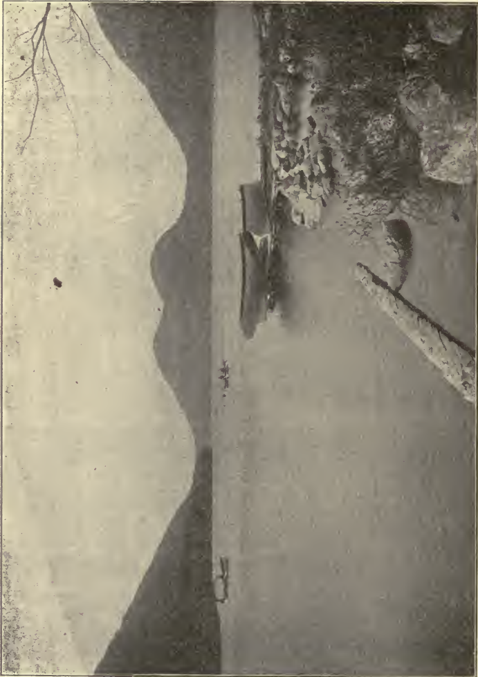
JORDAN POND LOOKING FROM THE SOUTH END